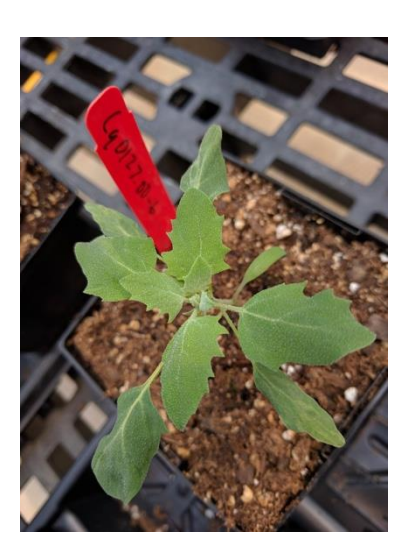
Plant age: 2 weeks (Wet media on left, dry media on right)