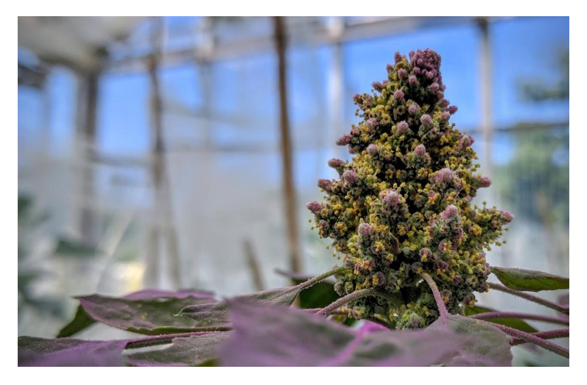
Plant Age: 6-8 weeks (cultivar dependent)