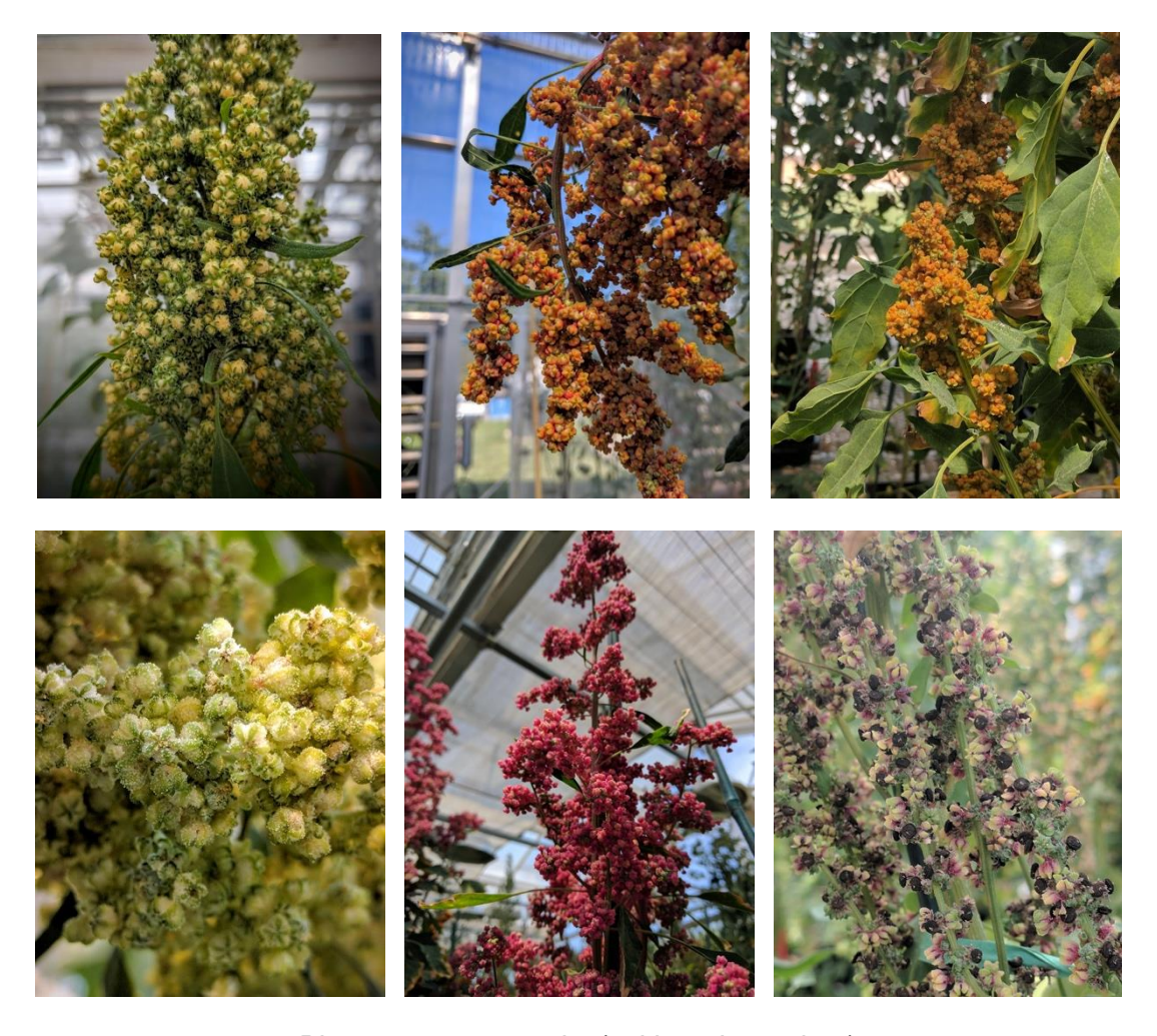
Plant age: 9-12 weeks (cultivar dependent)

4. When the seeds are mature, they dry up, shrink down a bit, and turn brown (pictured below). Begin withholding irrigation at this time, allowing the pots to dry out a little more between waterings. Fertilizer should only be applied 1x a week. Clear tap water for all other waterings, and at least one RO flush per week should be applied if possible: