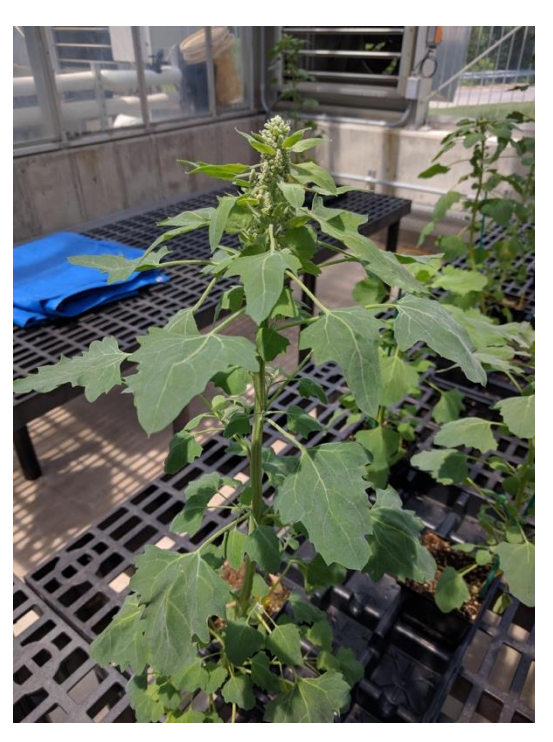
Plant age: 4+ weeks